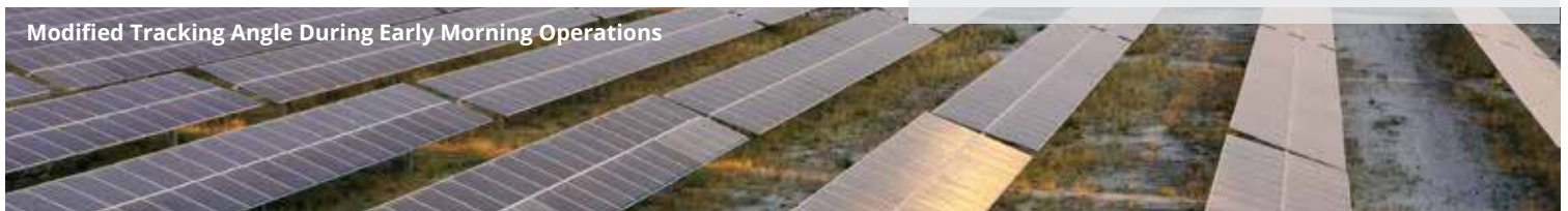
Modified Tracking Angle During Early Morning Operations

SunPath harnesses the predictive power of satellite imagery to forecast diffuse light conditions, triggering immediate system response and eliminating the need to install and maintain localized sensors.